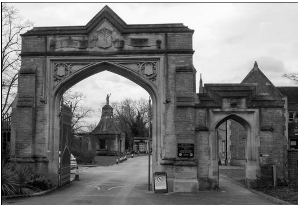
West Norwood Cemetery Gates, London 1837