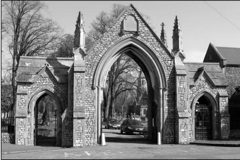
Kingston Cemetery Gates, London 1855