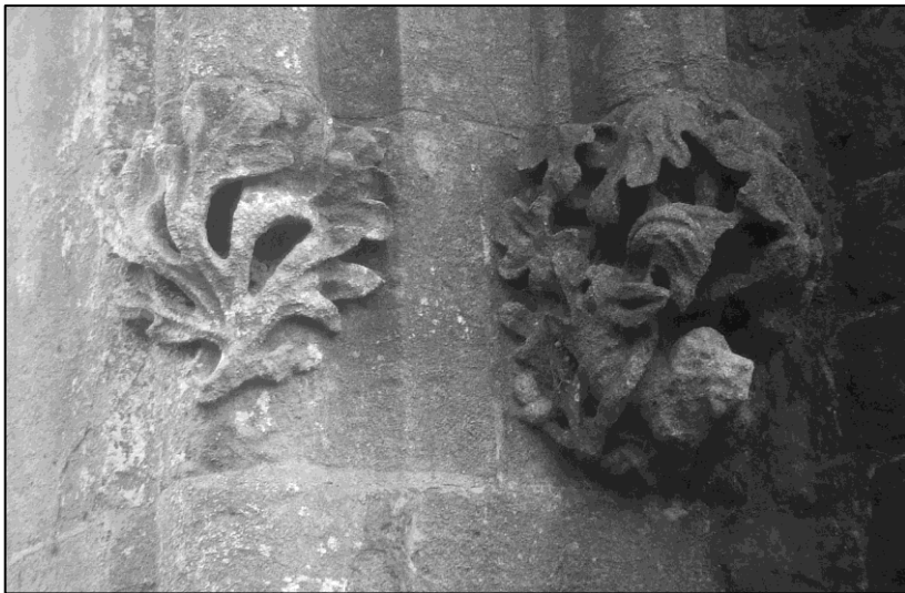
10. Left Right-Side Capital