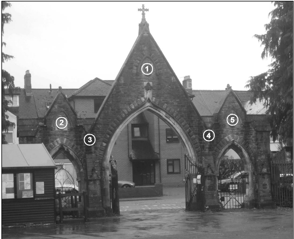
1. Central Shield - Cardiff Villa emblem, as seen on City Hall