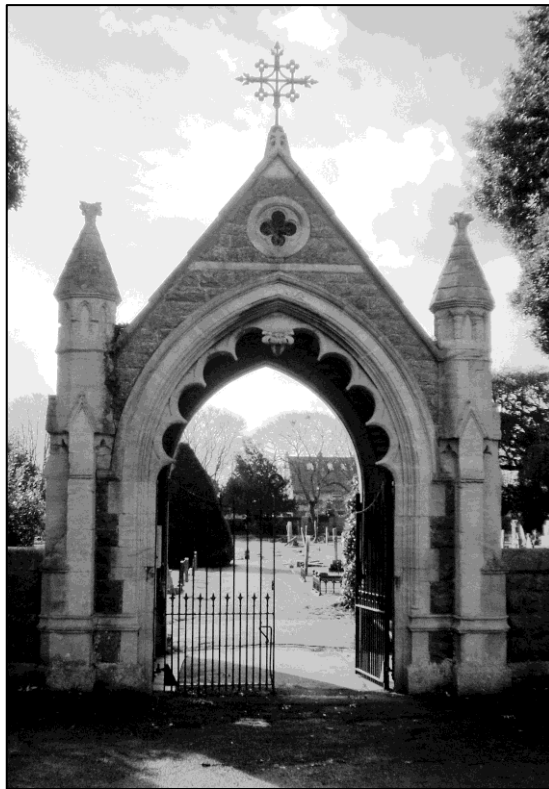
Burnham-on-Sea Cemetery Gate, Somerset 1885