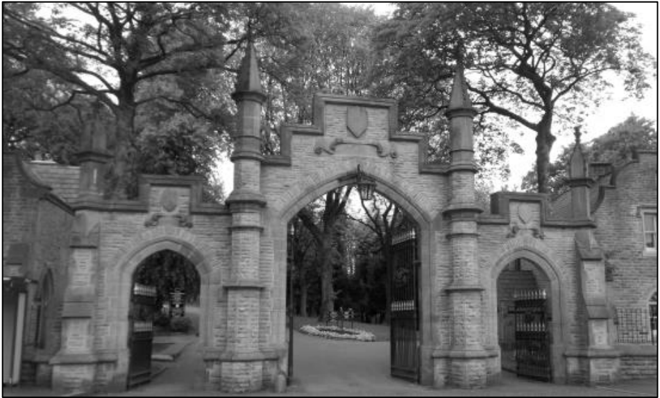
Rochdale Cemetery Gates 1855

Following are a few illustrations of contemporary designs used at Cemeteries in the UK.