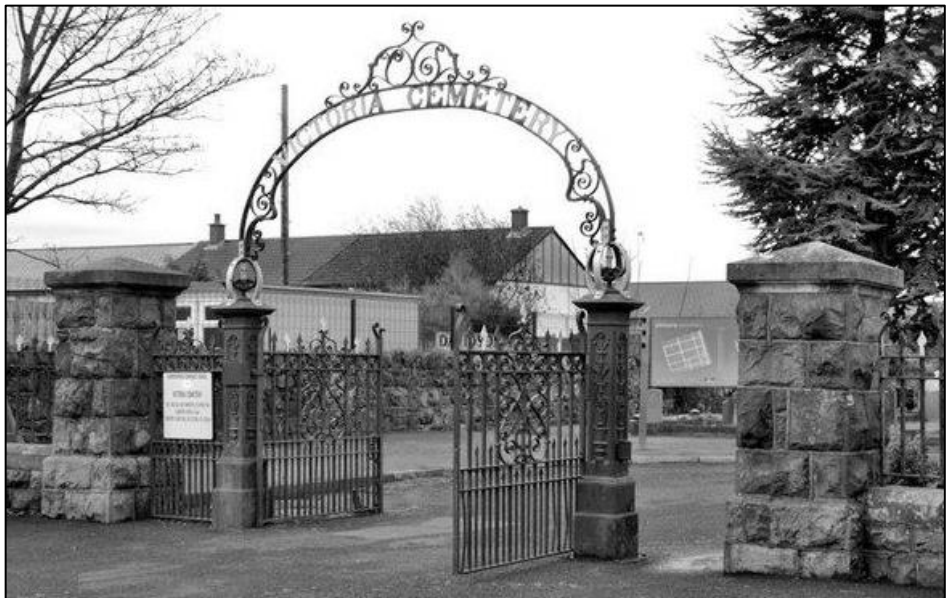
Victoria Cemetery Gates, Carrickfergus, 1904